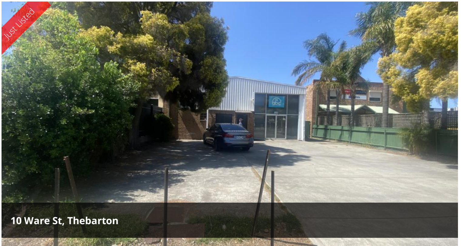
10 Ware St, Thebarton