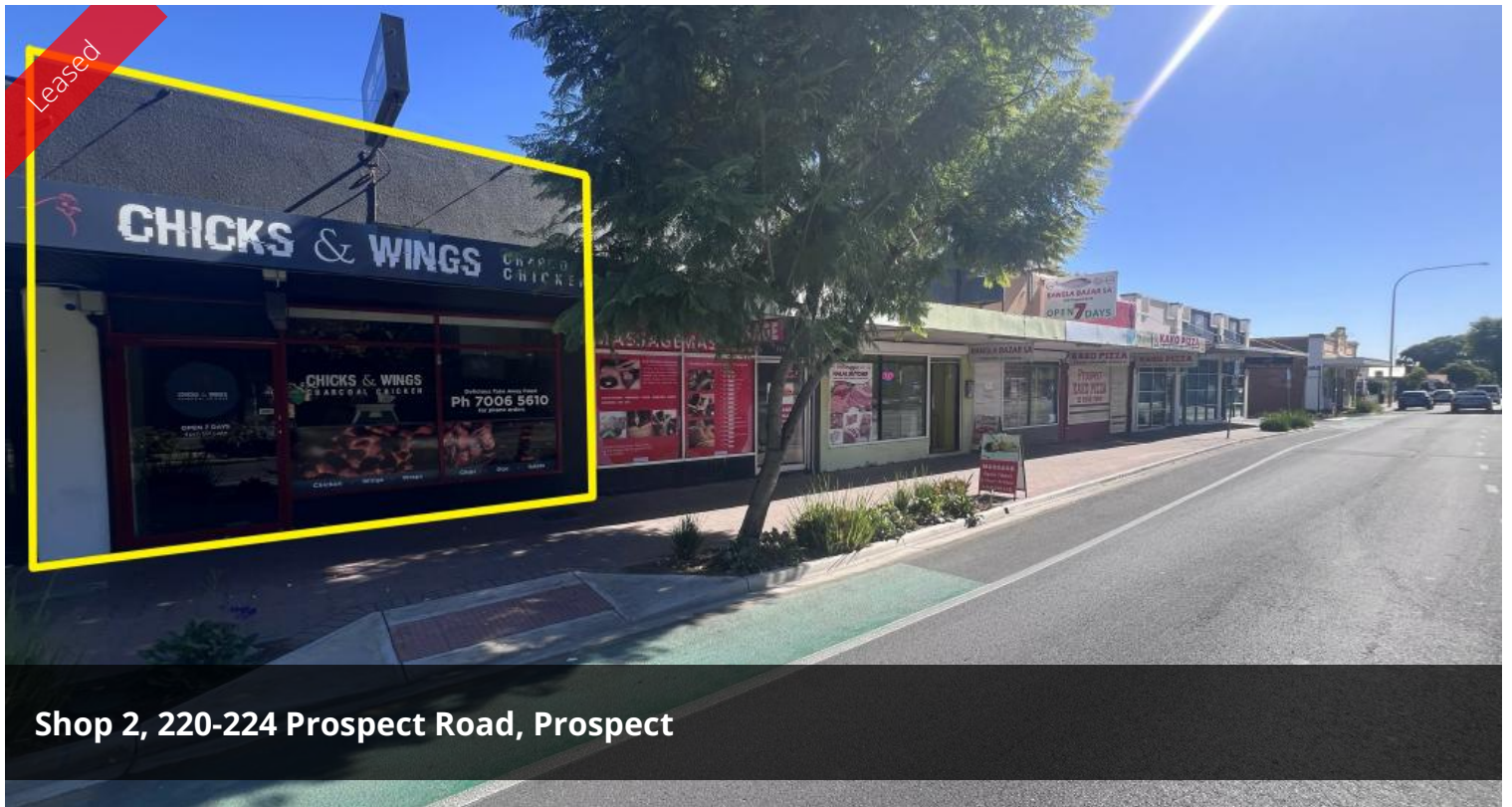
Shop 2, 220-224 Prospect Road, Prospect