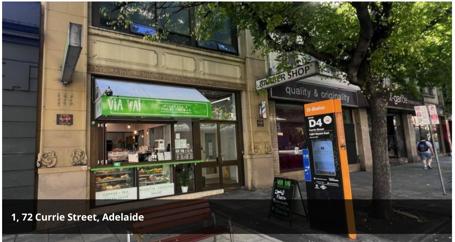
1, 72 Currie Street, Adelaide