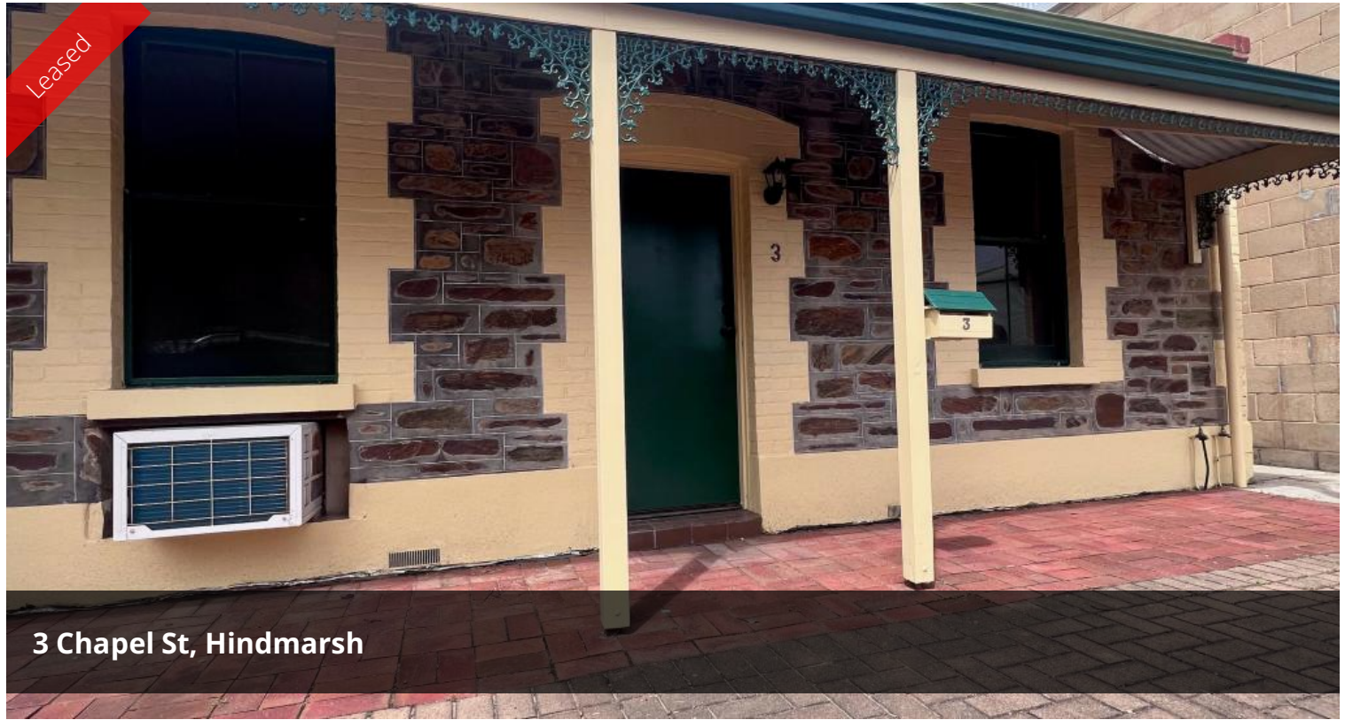
3 Chapel St, Hindmarsh