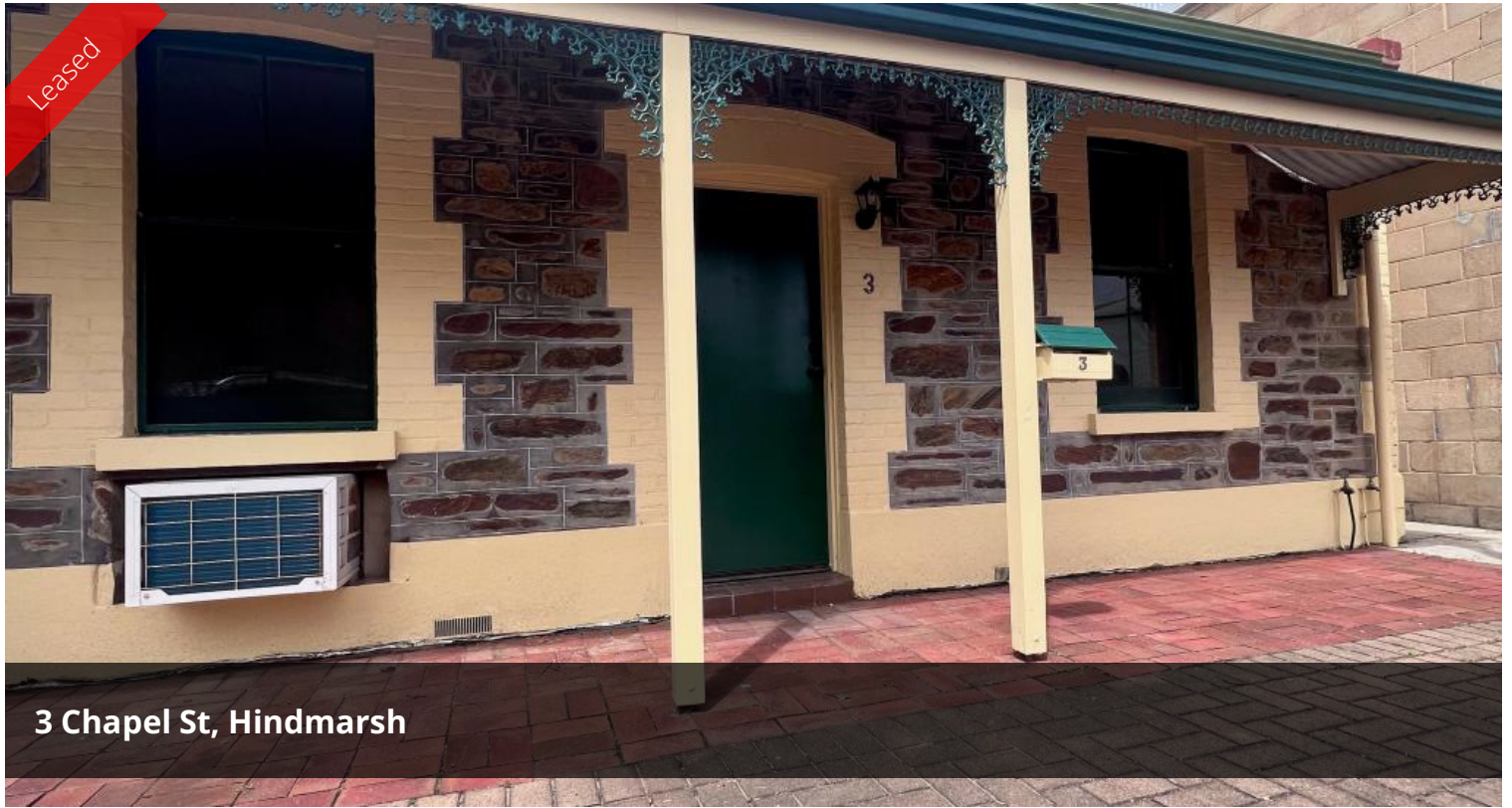
3 Chapel St, Hindmarsh