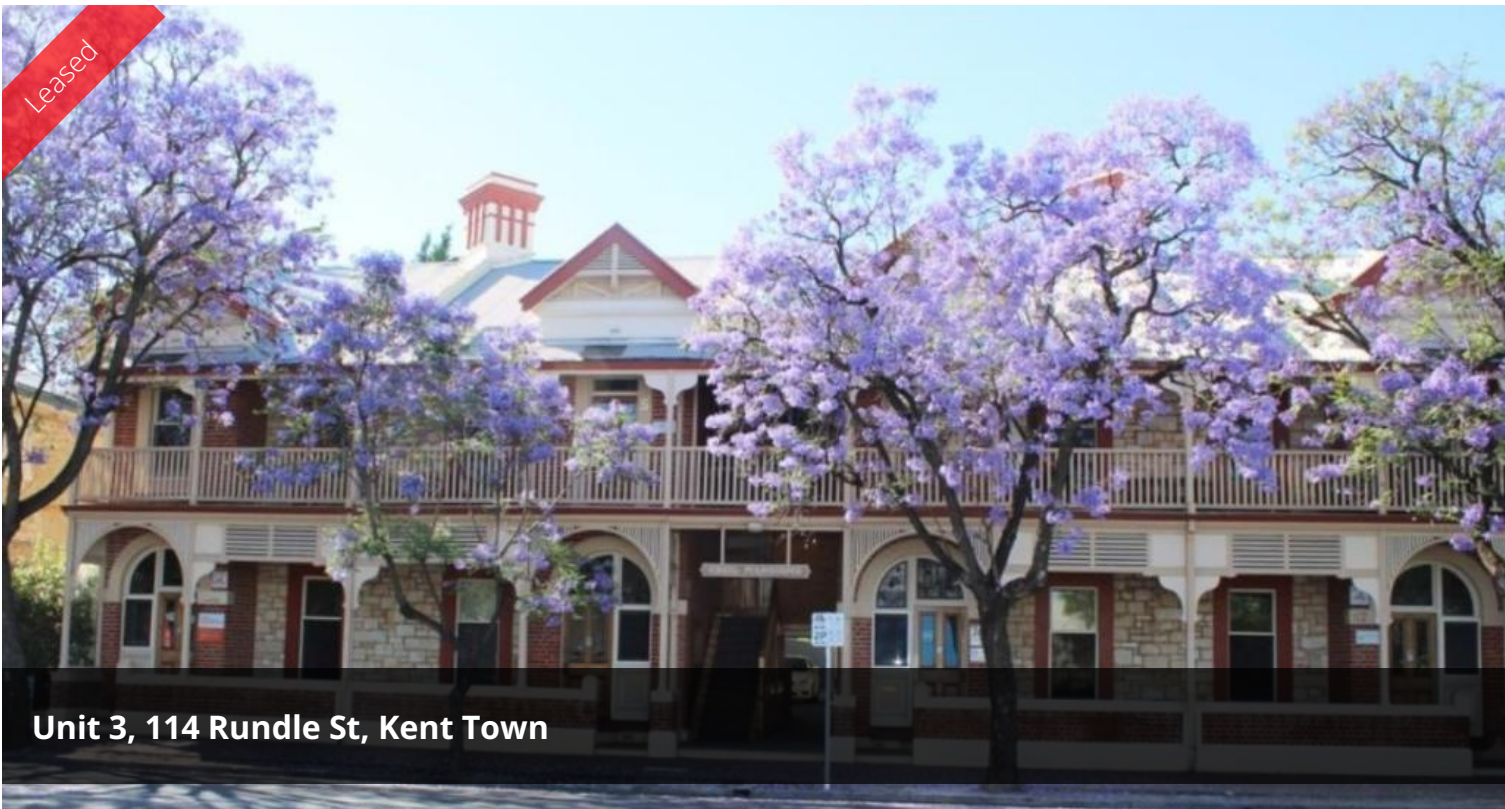
Unit 3, 114 Rundle St, Kent Town