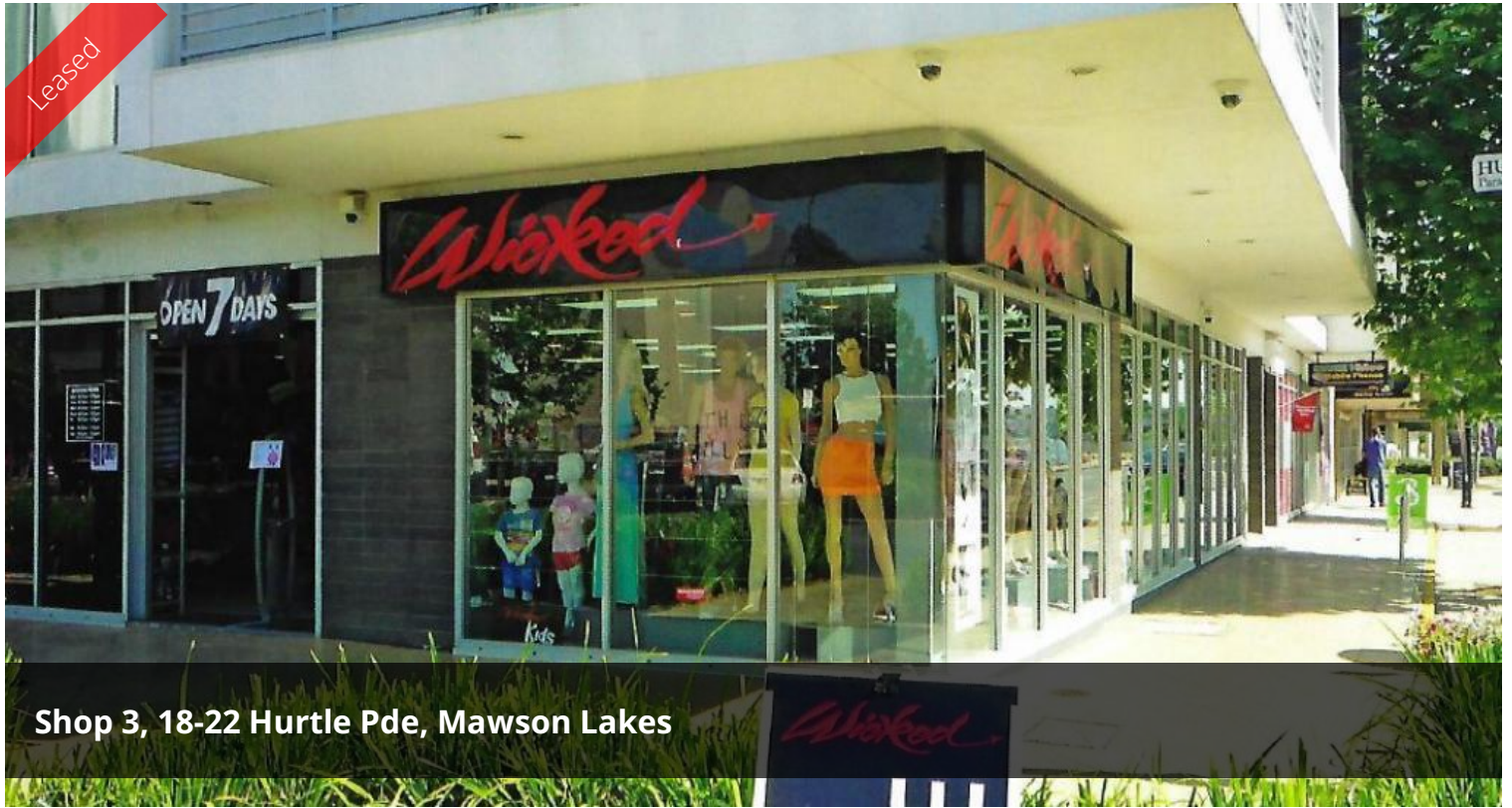
Shop 3, 18-22 Hurtle Pde, Mawson Lakes