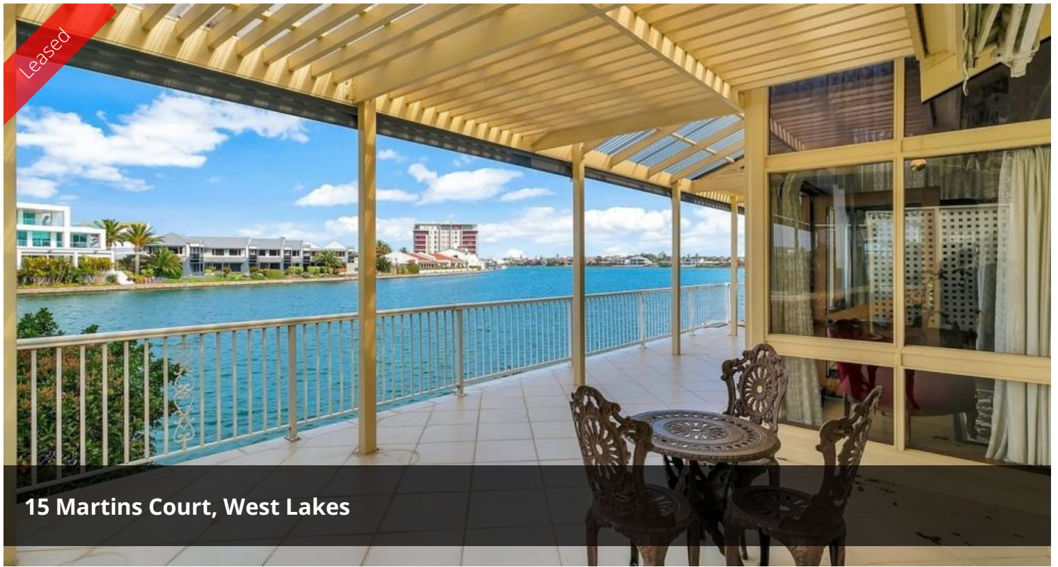
15 Martins Court, West Lakes