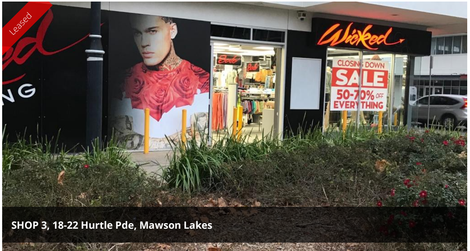
SHOP 3, 18-22 Hurtle Pde, Mawson Lakes