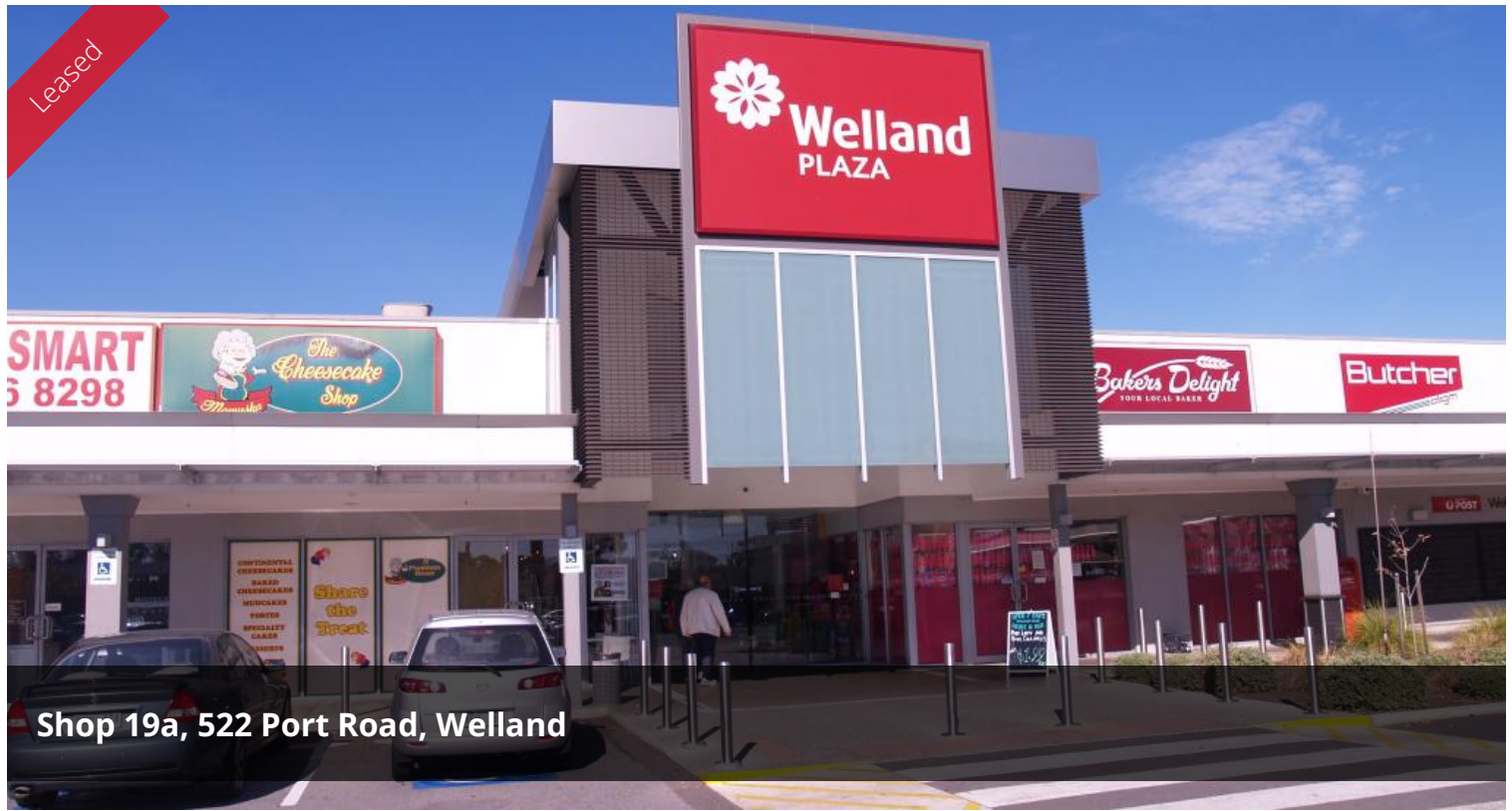
Shop 19a, 522 Port Road, Welland