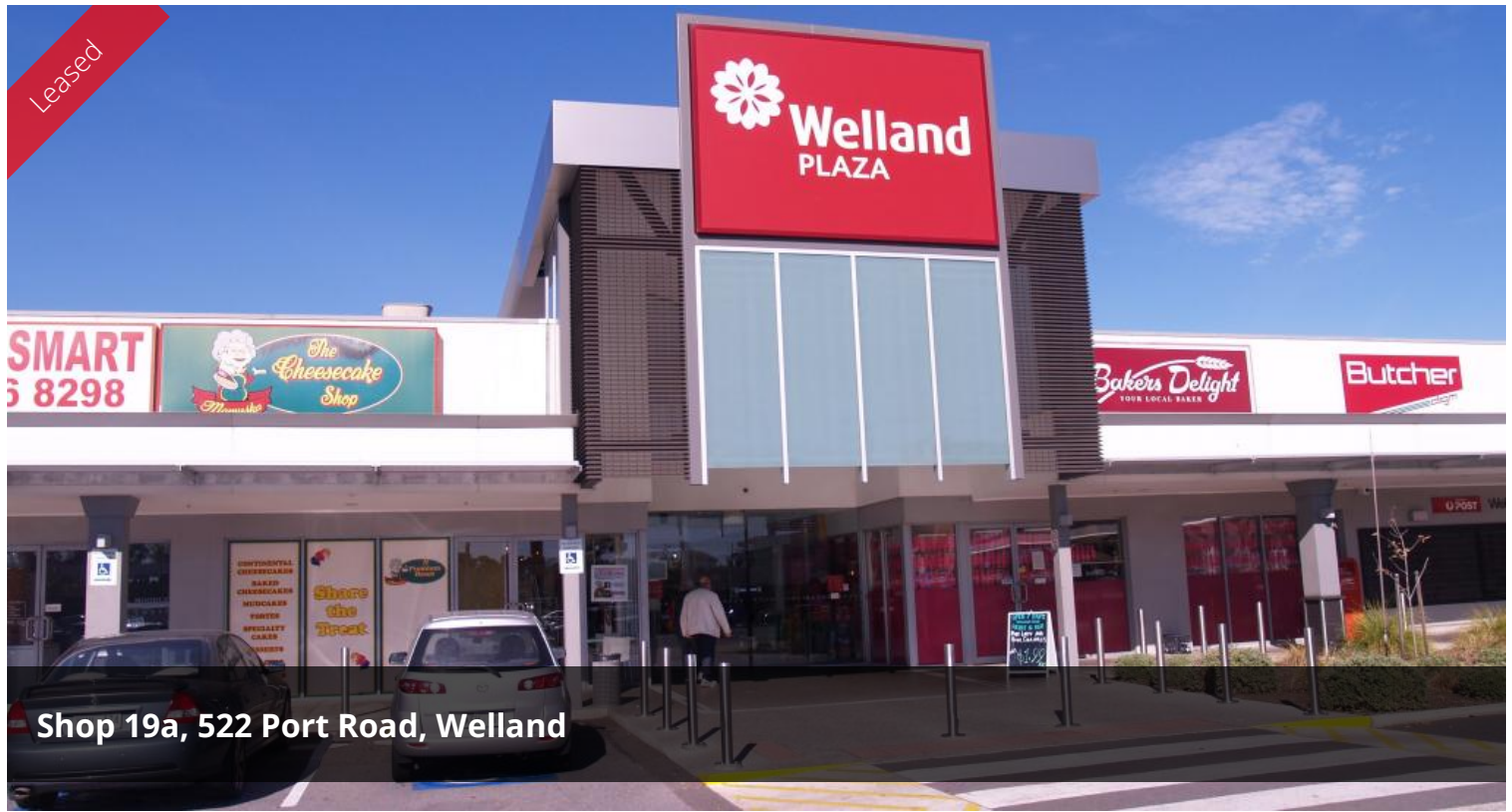
Shop 19a, 522 Port Road, Welland