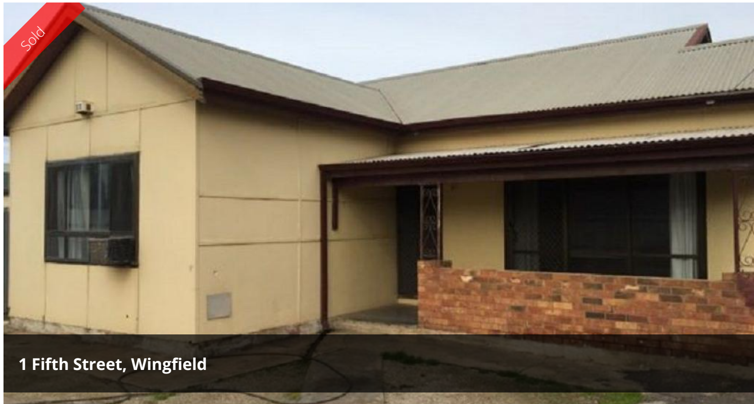
1 Fifth Street, Wingfield