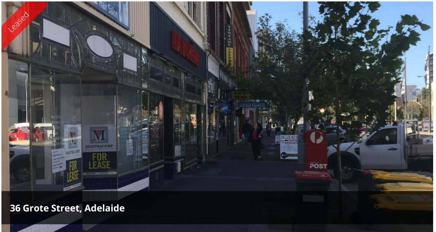
36 Grote Street, Adelaide