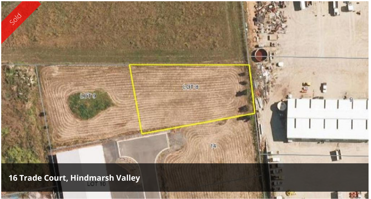
16 Trade Court, Hindmarsh Valley