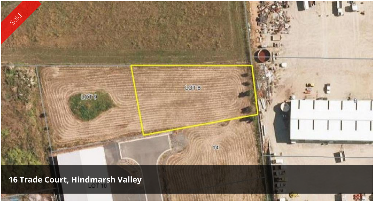
16 Trade Court, Hindmarsh Valley