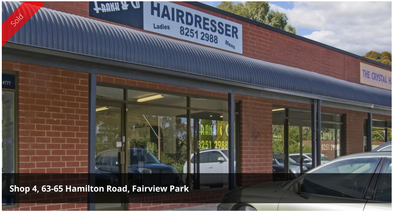
Shop 4, 63-65 Hamilton Road, Fairview Park