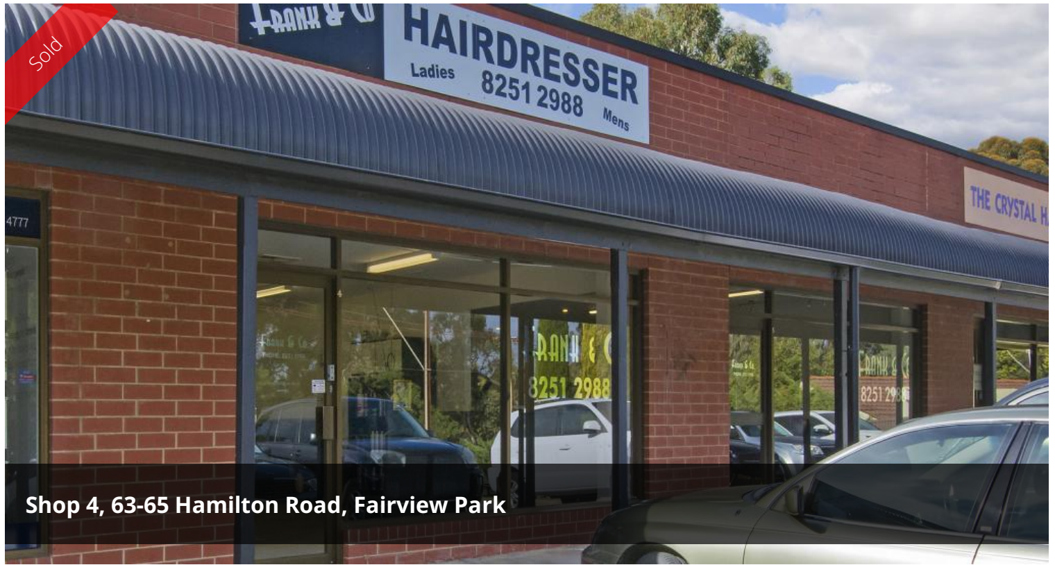
Shop 4, 63-65 Hamilton Road, Fairview Park